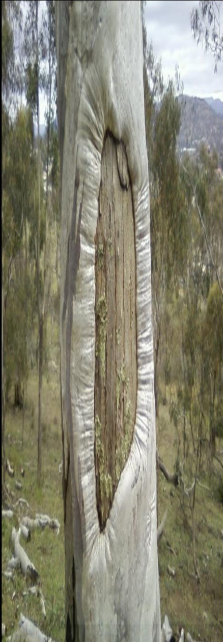
Ngunnawal land Scar Tree